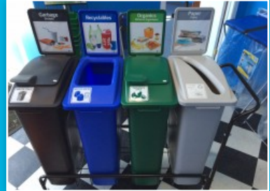
Pic 1: our new recycling bins! Yeah!

Ash Wednesday: we began lent with a very special inclusive service that featured both the imposition of ashes, and healing through the laying on of hands. The theme was star dust, in emphasizing that all of creation is made of this. We find our sense of brotherhood and sisterhood with one another and all of creation in this, and as people who embrace justice and peace.