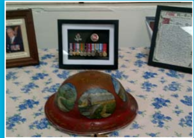
Pic 1: Remembrance Day in the church hall.

Remembrance Sunday was a very special event this year. Members of our local Legion attended, ushered in by a retired RCMP officer in red surge as flag bearer, and followed by Air Cadets, and reps from our Guides, Sparks, Brownies and Pathfinders. We observed Last Post, the placement of wreaths and a solo of In Flanders Fields. A children's talk involved giving youth paper cranes, a symbol of peace, to be placed at cenotaphs, and also on video games at home to remind them not to play war games on Remembrance Day.